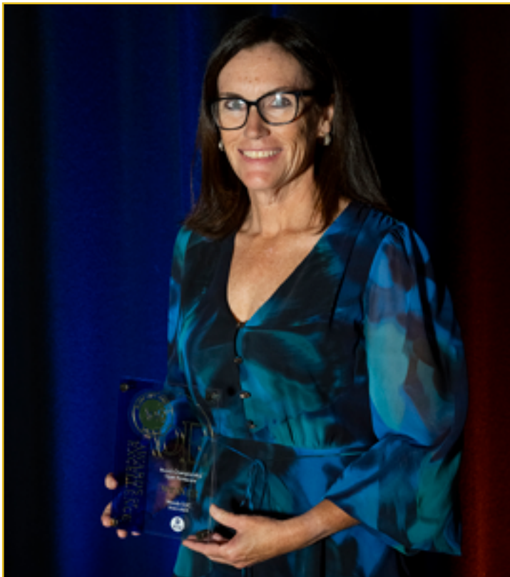
AGE / YOUTH - NORTH BONDI